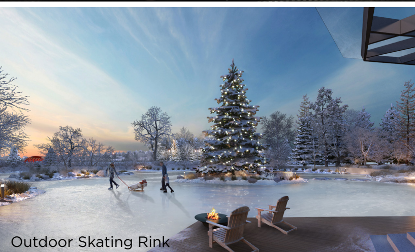
Outdoor Skating Rink