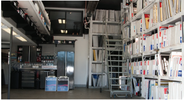
Riteway Sign's modern and efficient workshop in SE Calgary.