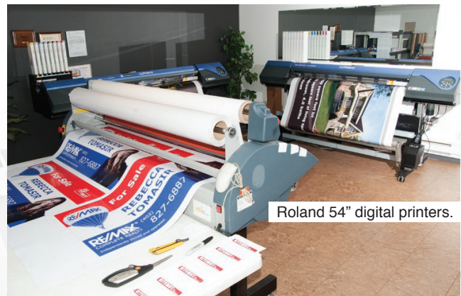
Roland 54" digital printers.

Riteway Signs is proud to be one of the city's top sign companies for real estate professionals, and the second generation is eager to carry its legacy into the next quarter-century.