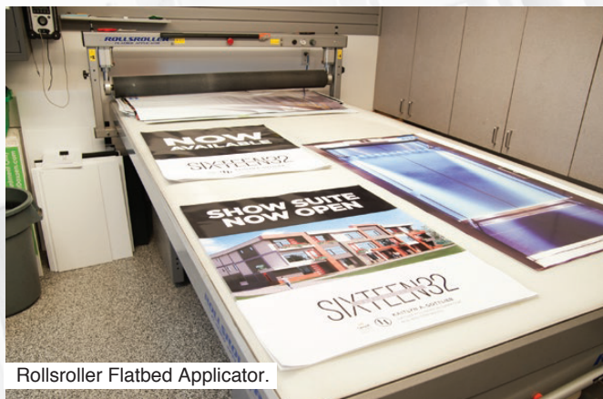
Rollsroller Flatbed Applicator.